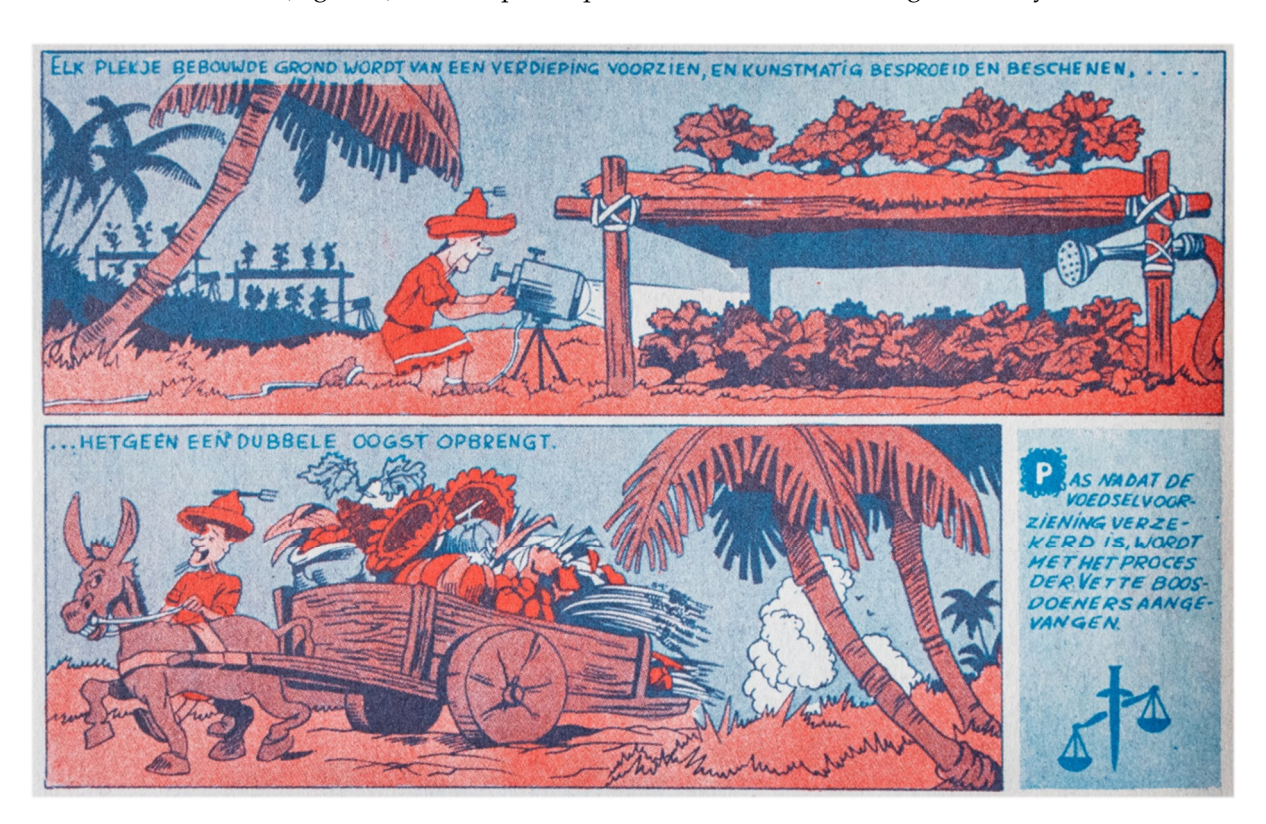
Figure 1. Two panels from the first Suske en Wiske (English: Spike and Suzy) comic strip Op het eiland Amoras by Willy Vandersteen depict a primitive vertical farm. The Belgian comic strip was published in De Nieuwe Standaard from 19, 1945 December to 13 May 1946. Its caption reads: "Every patch of cultivated land is storeyed and artificially watered and lit, yielding a double harvest."